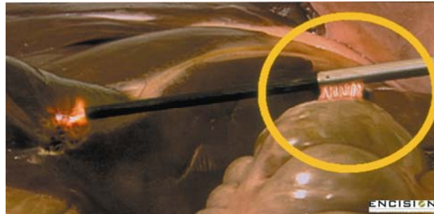
Figure 1. Example of Capacitive Coupling from Metal Cannula